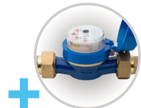
Add optional flow meter for flow alerts and monitoring water consumption