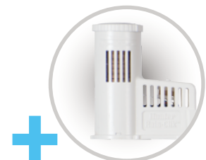
Add a Rain-Clik® for improved protection and onsite shutoff